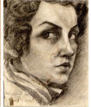
Fahrelnissa Zeid is one of the pioneers of modern art and belongs to the group of artists called the 'Paris School.'